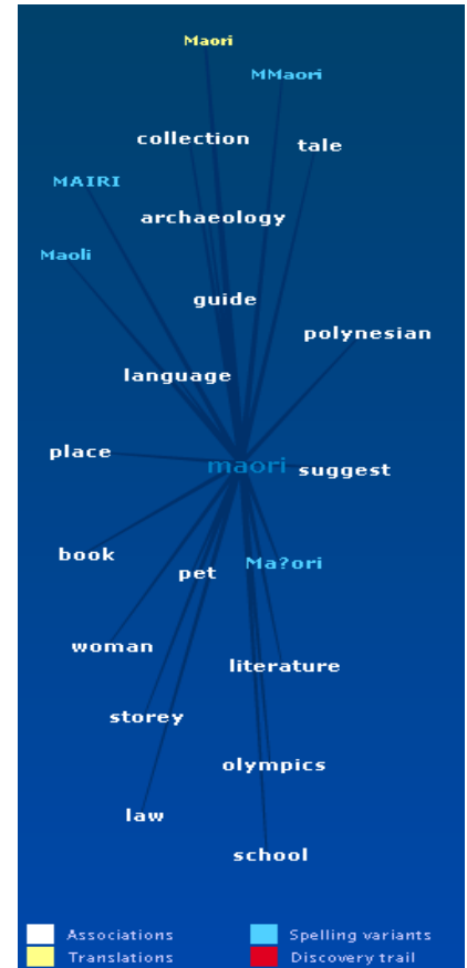
Māori Thesaurus Subject Headings